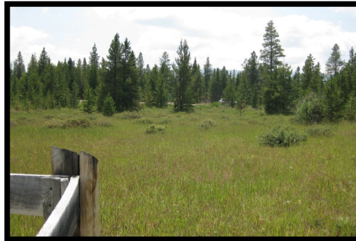
Daisy Meadows Conservation Easement 60 acres granted in 2000

Near the end of 2021, CHLT renewed our accreditation with the Land Trust Accreditation Commission, an independent arm of the Land Trust Alliance tasked with ensuring land trusts adhere to the Land Trust Standards and Practices .